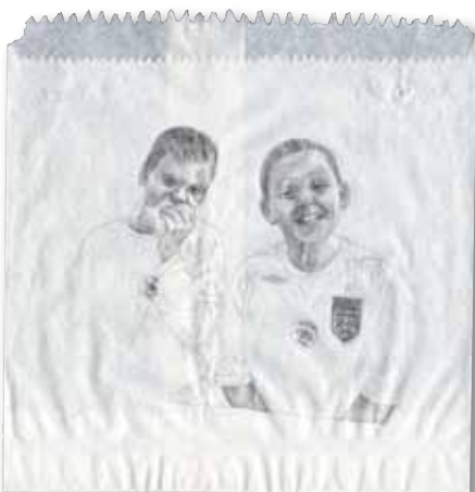
Exhibition pieces by: Beatrice Haines

Derbyshire Open Arts weekend (24th-26th May) and runs from 17th May to 1st June. The fortnight is a chance for grassroots artists to show their work alongside more established practitioners. The Festival has been created by practicing artists themselves, who are all passionate about using contemporary arts to raise the profile of New Mills, with all the social and economic benefits that can bring.