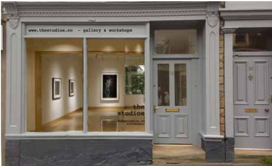
New Mills' The Studios